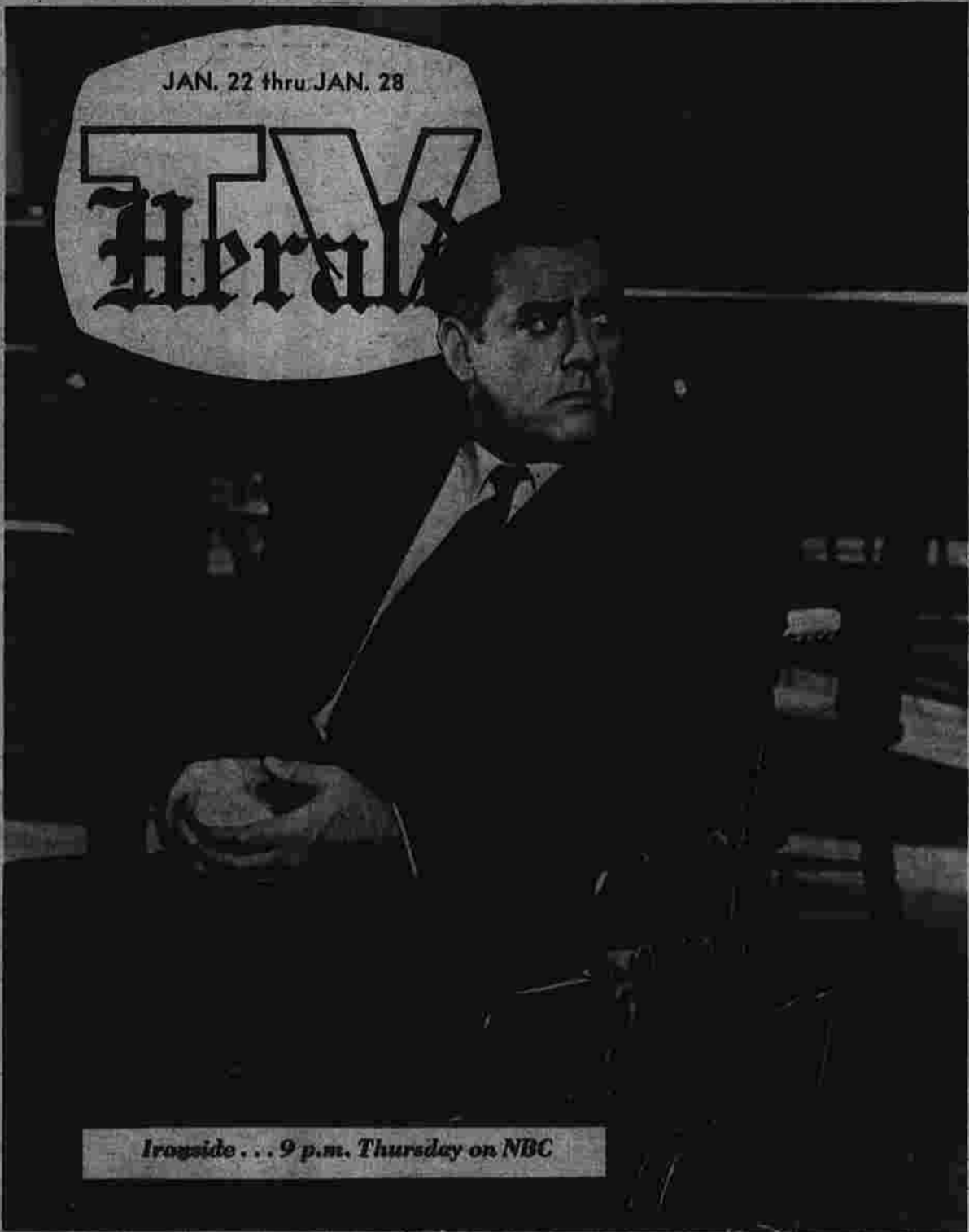
Ironside . . . 9 p.m. Thursday on NBC