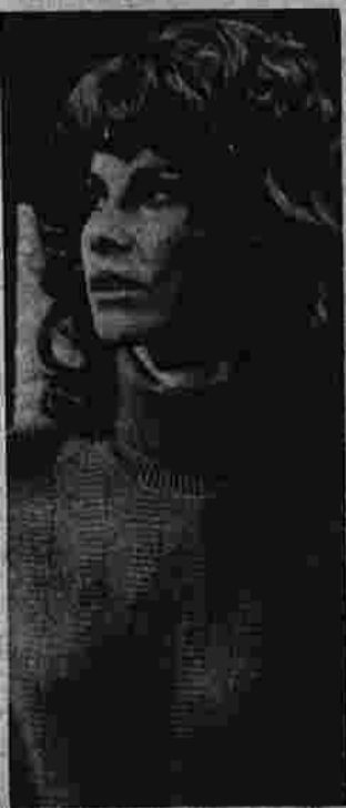
Stephanie Powers guest-stars in "Owen Marshall, Counselor at Law," 10 p.m. Thursday on ABC.