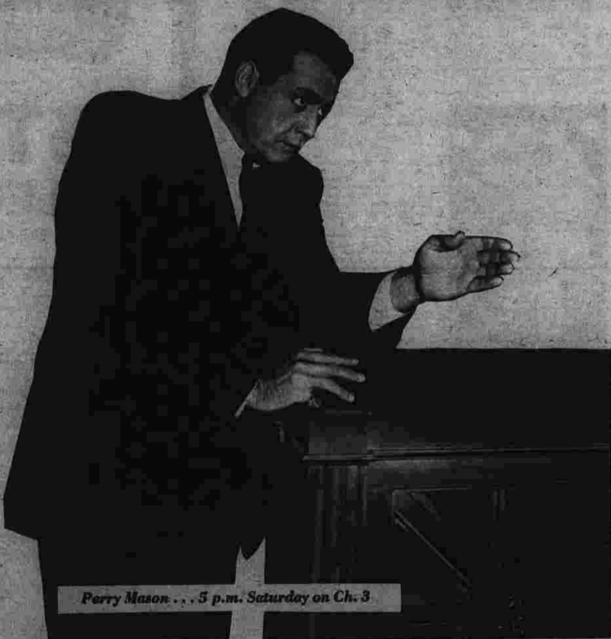
Perry Mason . . . 5 p.m. Saturday on Ch. 3