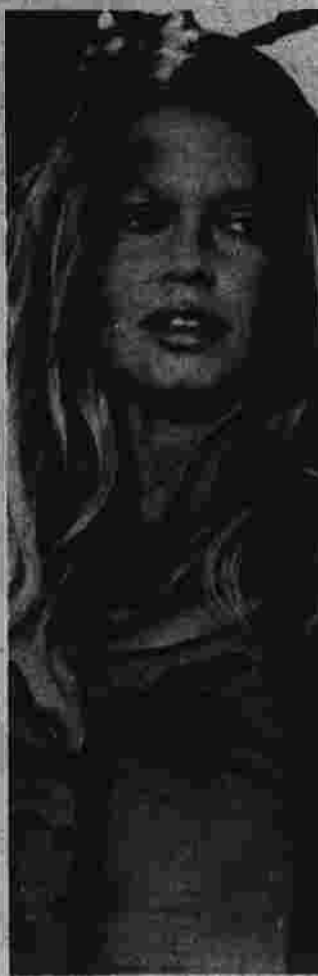
Brigitte Bardot appears on NBC News' "Chronolog," Friday at 8:30 p.m.