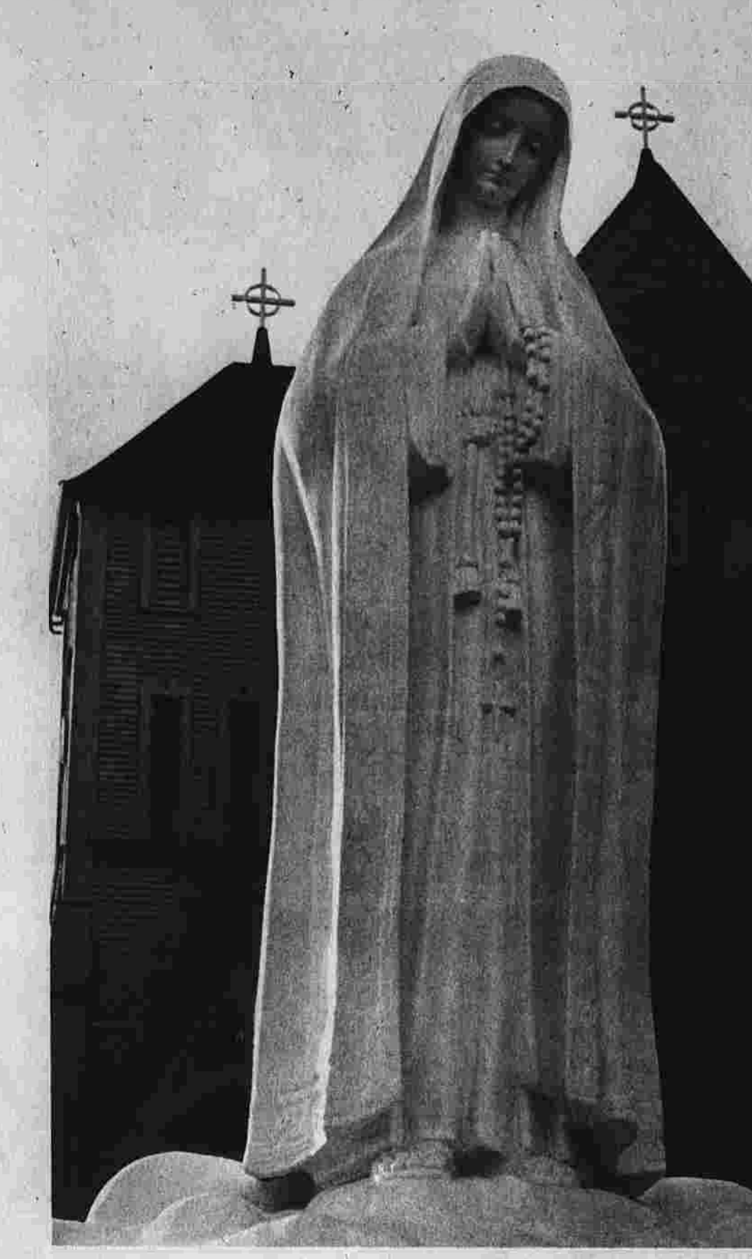
ST. JAMES CHURCH

Should the court decide otherwise, then the whole issue is left wide open, and with it a host of questions. Primary among these is what action to take about the 670 condemned prisoners who now sit in death-row cells. Pending this case, there has not been an execution since June, 1967.